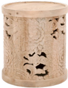
FLORA END TABLE 1867.NBM

Lotus Collection products are made with natural stone, antiqued metals, painted finish and reclaimed wood. These products include unavoidable variation in color, texture, uneven grain, blemishes, scratches, marks, and cracks . These features are not defects, but rather the material's natural characteristics. By ordering products from this collection, you accept the characteristics unique to each item and agree that no claims will be approved regarding these natural variations. Special care should be taken to protect these natural finishes.