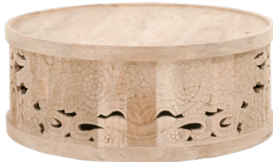
FLORA COFFEE TABLE 1866.NBM